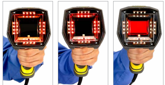
30-, 45-, and 90-degree lighting