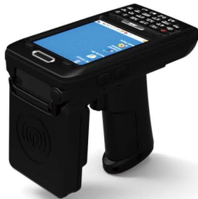
UHF GUN READER