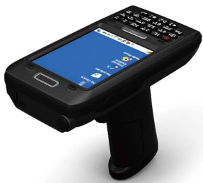
HF BARCODE READER